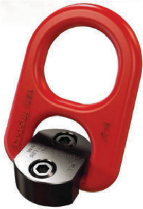
HR-100 UNC HR-100M METRIC